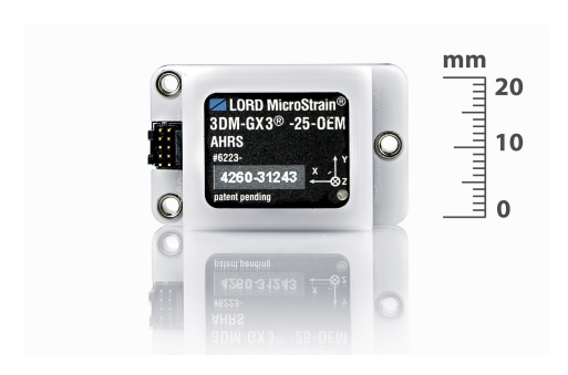
3DM-GX3-25-OEM<sup>™</sup> - lower cost, miniature, industrial-grade attitude heading and reference system (AHRS) with integrated magnetometers, and OEM form factor

The LORD MicroStrain<sup>®</sup> family of industrial and tactical grade inertial sensors provides a wide range of triaxial inertial measurements and computed attitude and navigation solutions.