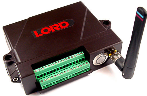
V-Link-200 Series - versatile, ruggedized, eight-channel analog sensor node with high sample rates and datalogging capability

LORD Sensing LXRS Wireless Sensor Networks enable simultaneous, high-speed sensing and data aggregation from scalable sensor networks. Our wireless sensing systems are ideal for test and measurement, remote monitoring, system performance analysis, and embedded applications.