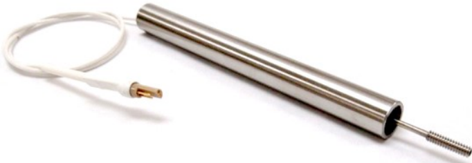
LS-LVDT- robust and highly accurate displacement sensor with revolutionary stroke-body length ratios

Ideal for linear control and precision measurement applications, the miniature LS- LVDT provides fast response and rugged packaging. Configuration options can provide cutting-edge features, including micron resolution, linear analog output, flat dynamic response to kHz levels, and/or very low temperature coefficients. Its free sliding transducer core is lightweight, strong, and corrosion-resistant. The cores are precision ground to insure a close sliding fit within the open bore of the stainless steel lined LS-LVDT body. This precision allows the LS-LVDT to achieve extremely high repeatability. The sensing head is capable of total submersion in aqueous environments. NOTE: This sensor is designed for use with LORD Sensing DEMOD signal conditioners.