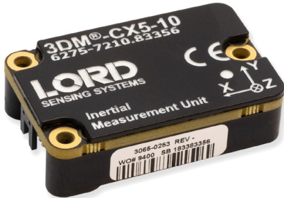
3DM-CX5-10 – high-performance, industrial-grade inertial measurement unit (IMU)

The LORD Sensing 3DM-CX5 family of high-performance, industrial-grade, board-level inertial sensors provide a wide range of triaxial inertial measurements and computed attitude and navigation solutions.