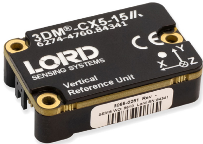
3DM-CX5-15 – miniature, high-performance, industrial-grade inertial measurement unit (IMU) and vertical reference unit (VRU)

The LORD Sensing 3DM-CX5 family of high-performance, industrial-grade, board-level inertial sensors provide a wide range of triaxial inertial measurements and computed attitude and navigation solutions.