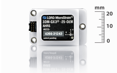
3DM-GX3-25-OEM™ - lower cost, miniature, industrial-grade attitude heading and reference system (AHRS) with integrated magnetometers, and OEM form factor

The LORD MicroStrain® family of industrial and tactical grade inertial sensors provides a wide range of triaxial inertial measurements and computed attitude and navigation solutions.