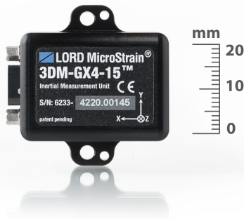
3DM-GX4-15™ - miniature industrial-grade inertial measurement unit (IMU) and vertical reference unit (VRU) with high noise immunity, and exceptional performance

The LORD MicroStrain® family of industrial and tactical grade inertial sensors provides a wide range of triaxial inertial measurements and computed attitude and navigation solutions.