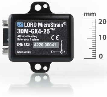
3DM-GX4-25™ - miniature industrial-grade attitude heading and reference system (AHRS) with integrated magnetometers, high noise immunity, and exceptional performance

The LORD MicroStrain® family of industrial and tactical grade inertial sensors provides a wide range of triaxial inertial measurements and computed attitude and navigation solutions.