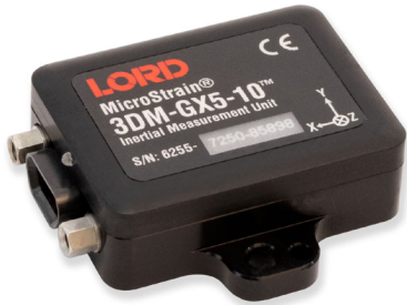
3DM-GX5-10 – high-performance, industrial-grade inertial measurement unit (IMU)

The LORD Sensing 3DM-GX5 family of high-performance, industrial-grade inertial sensors provides a wide range of triaxial inertial measurements and computed attitude and navigation solutions.