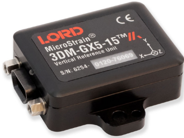
3DM-GX5-15 – miniature, high-performance, industrial-grade inertial measurement unit (IMU) and vertical reference unit (VRU)

The LORD Sensing 3DM-GX5 family of high-performance, industrial-grade inertial sensors provides a wide range of triaxial inertial measurements and computed attitude and navigation solutions.