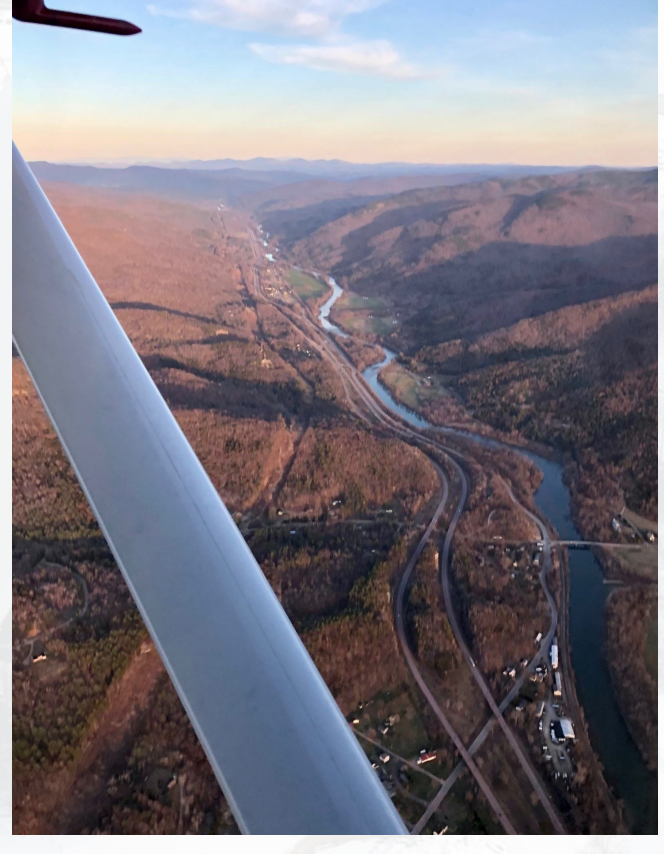
Looking east to Mt. Washington above Route 89 South, Jonesville, VT

1) Start recording 2) Takeoff and climb to 3000' 3) Fly away from airport to practice area for magnetometer calibration 4) Execute clearing turns and clear airspace of practice area for aircraft traffic