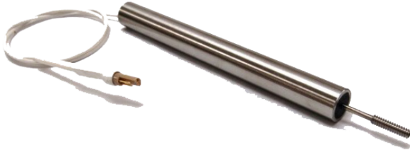
LS-LVDT Robust and highly accurate displacement sensor with sub-micron resolution and revolutionary stroke-body length ratio

The miniature LS-LVDT provides fast response and rugged packaging and is ideal for linear control and precision measurement applications. Configuration options provide cutting-edge features, including sub-micron resolution, linear analog output, flat dynamic response to kHz levels, and very low temperature coefficients. The free sliding transducer core is lightweight, strong, and corrosion-resistant. Cores are precision ground to ensure a close sliding fit within the open bore of the stainless steel lined LS-LVDT body. This precision allows the LS-LVDT to achieve extremely high repeatability. The sensing head is capable of total submersion in aqueous environments.