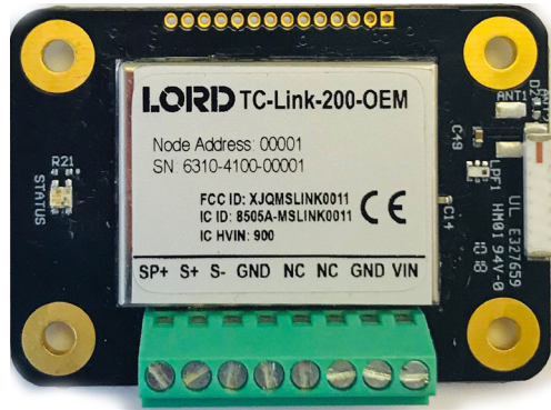
TC-Link-200-OEM – Small, low-cost, single channel temperature sensor node ready for OEM integration

The TC-Link-200-OEM allows users to collect data from a range of sensor types including Thermocouples, Resistance Thermometers, and Thermistors. The node supports high resolution, low noise data collection from 1 temperature transducer at sample rates up to 128 Hz.